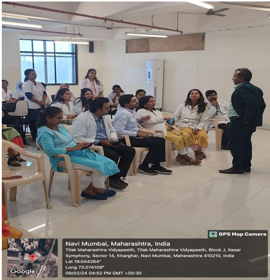
Photography 6: Encouraging active interaction with participants